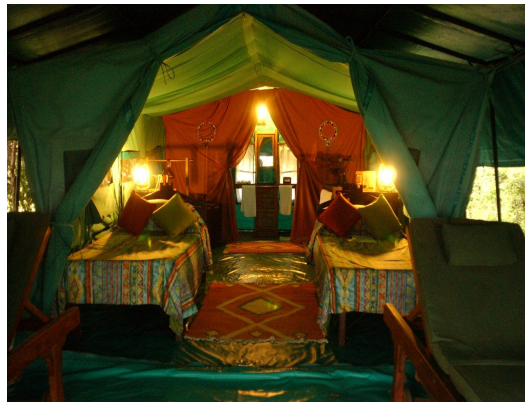
(B, L, D)