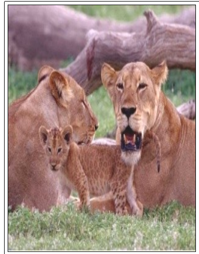
(B, L, D)