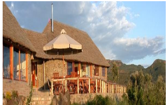
(B, L, D)