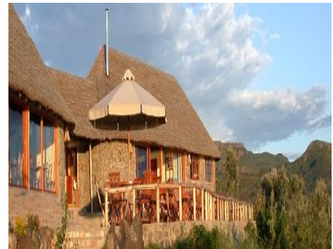
(B, L, D)

This Lodge is named after one of the more than 450 species of birds in this area. The Sunbird lodge has spectacular views over Lake Elementaita and guests can experience the amazing sunsets from the verandahs of the cottages.